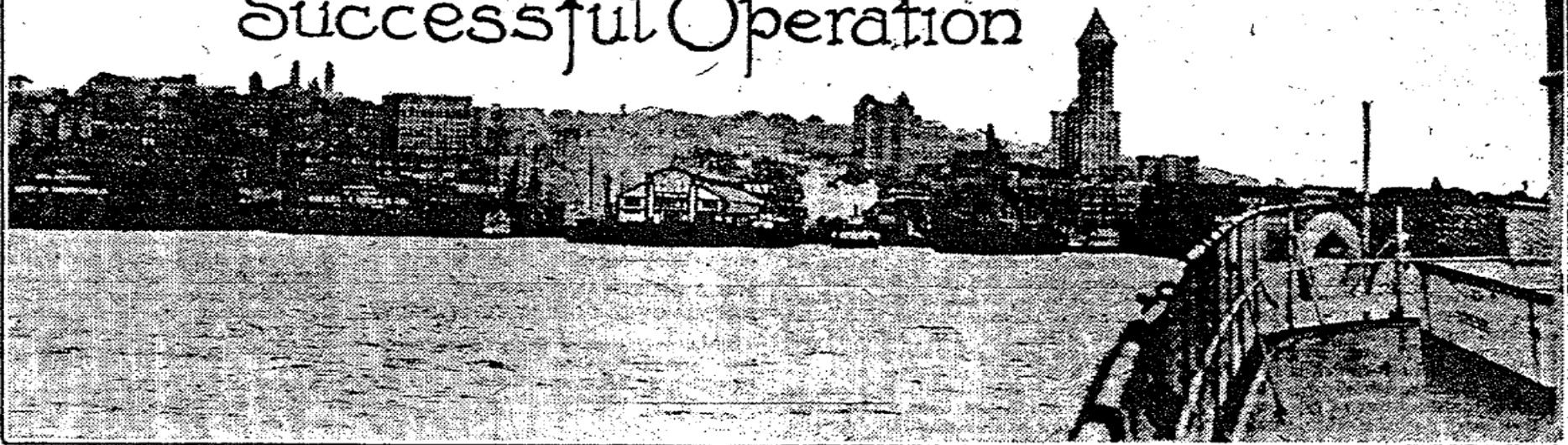
Part of the waterfront at Seattle, taken by the author from the deck of the Steamer Tacoma. The white smoke obscuring part of the buildings on the waterfront in the middle of the picture is from the publicly-owned West Seattle ferry. The ferry can be seen just under the smoke cloud. It was raining when the picture was taken.

By Oliver S. Morris America's Best Example of Public Ownership in Successful Operation