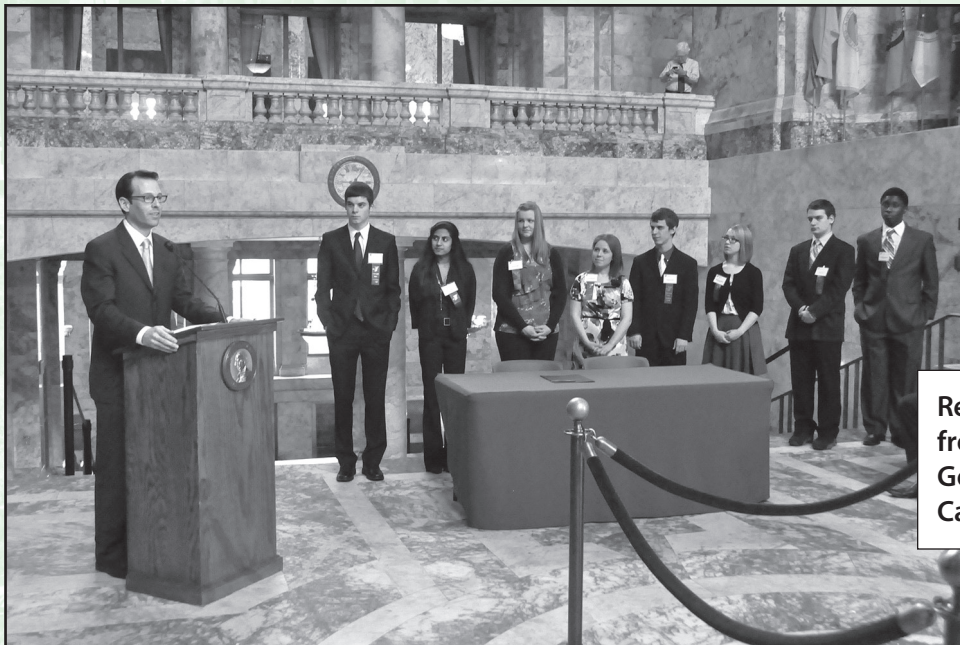
Rep. Billig speaks with students from the YMCA Youth and Government program in the Capitol Rotunda.

Equal rights also means equal access. I sponsored legislation to grant equal access to voter registration for young voters. Currently, we deny access to the most popular method of voter registration – Motor Voter – to many young voters when we should instead be encouraging their participation in civic life. Although the bill didn't pass the Legislature this session, I will continue my efforts to fix this inequity.