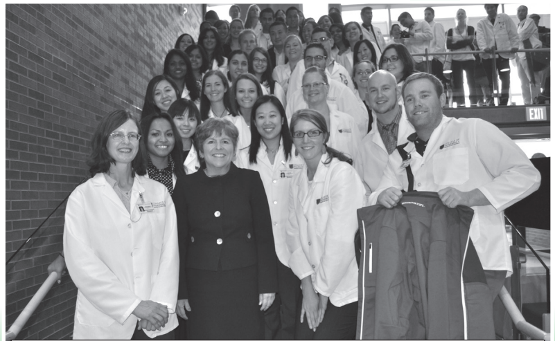
Senator Brown with WSU pharmacy students at the groundbreaking of the Biomedical and Health Sciences Building.